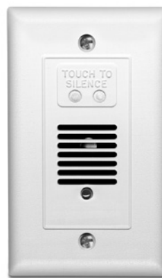
683-1C, 684-1C U.S. Pat. 6,144,289